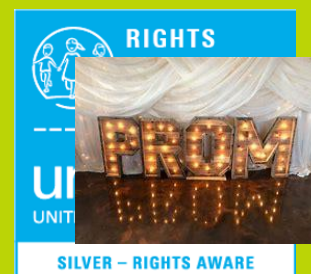
SILVER – RIGHTS AWARE

Our Parent Calendar can be found by clicking here